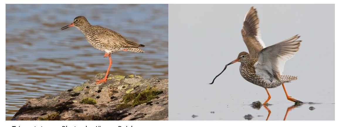
Tringa totanus.

The redshank is a widespread breeder across much of Europe. The European breeding population counts >280 000 bp, of which about 10–15% are breeding in the Baltic Sea area. The species has undergone a moderate decline across much of its European range, and this trend is also true for the Baltic Sea area.