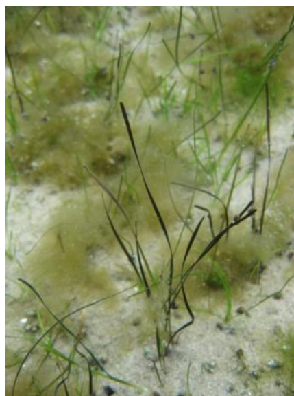
Zostera noltii – dark green plants growing within young Zannichellia palustris plants (light green) and epiphytes by Karin Fürhaupter.

Z. noltii was included in the previous HELCOM list of threatened and/or declining species (HELCOM 2007).